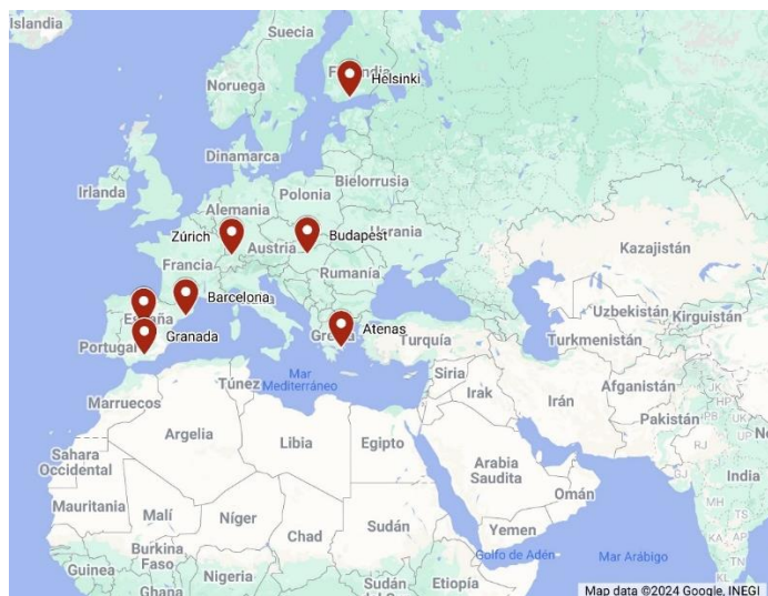
Figure 1: Location of the station (Source: My maps – google map).